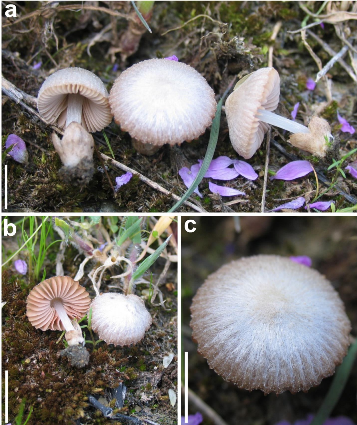
Figure 2. Fresh basidiomata of Volvariella pilosipilea . Scale bars = 5 mm