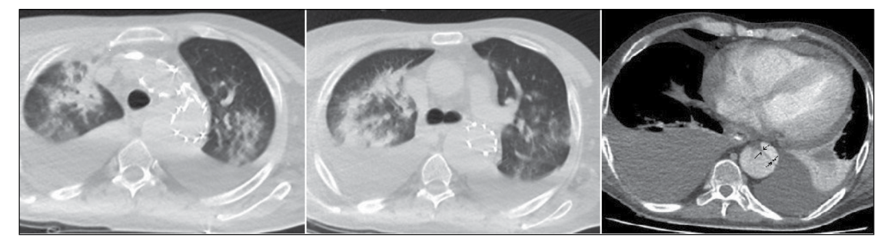
Figure 3. Regression in pulmonary infitrates on the 10th day of ganciclovir treatment.

Antibodies for CMV were positive for IgG and negative for IgM. The CMV DNA level examined by PCR in a plasma sample was 41126 IU/mL (range: 0-1000). Intravenous ganciclovir was started at a dose of 2x5 mg/kg. On the 10th day of ganciclovir treatment he had a better clinical condition, CMV DNA units, and serum inflammatory markers were decreased. Laboratory values of the patient at presentation and follow-up are given in Table 1. Another thoracic CT scan revealed that pulmonary infiltrates had regressed yet pleural effusions were continu-