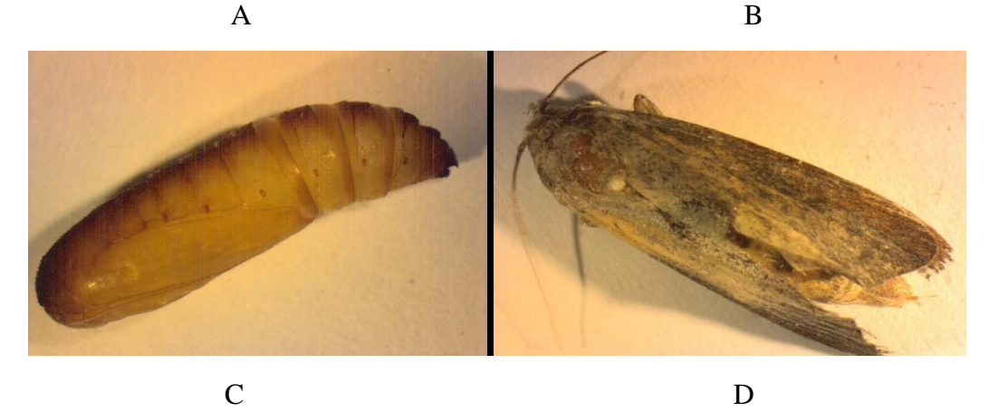
Figure 2. Galleria mellonella life cycle (A:Eggs, B: Larvae, C:Pupae, D: Adult)