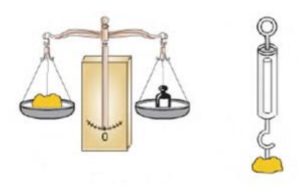
Figure 2: Equal-arm scale and dynamometer (Url-2, 2017)

The mass is the amount of unchangeable substance. It is indicated by the symbol m. Measured with equal-arm scales. Unit for mass is kilogram. The mass is a scaler magnitude.