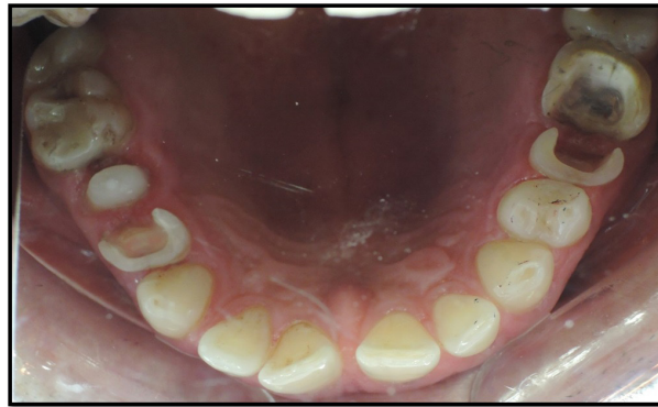
Figure 1. Preparation of the teeth for endocrown.

For endocrown preparations temporary filling restorations removed. The preparation consisted of a circular equigingival butt-joint margin and central retention cavity into the entire pulp chamber constructing both the crown and the core as a single unit (Figure 1). After cavity preparations, flowable composite (Filtek TM Bulk Fill Flowable Restorative, 3M ESPE GmbH, Neuss, Germany) were applied into the isolated cavities to eliminate the undercuts. The appropriate reduction of the buccal and lingual walls was done and interocclusal space was carefully evaluated. Occlusal reduction was done to achieve a clearance of 2 mm.