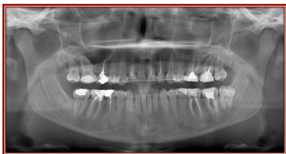
Figure 3 OPG After Orthodontic Treatment

Over a period of 15 months, orthodontic treatment was completed. On the right side Class I molar occlusion and on the left side full cusp Class II molar occlusion with a Class I canine relationship and 2 mm overjet and overbite for both sides were obtained (Fig 3).