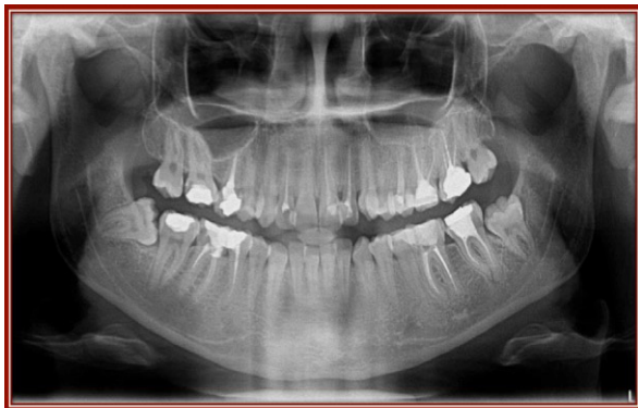
Figure 1 OPG Before Orthodontic Treatment

A 22-year-old female patient who had Angle Class I malocclusion, crowding and 4 mm midline shift in the maxillary anterior region (Fig 1), was referred to Department of Orthodontics, for existing orthodontic treatment. Patient had started her orthodontic treatment in another clinic and her upper left second premolar teeth was extracted in order to correct upper jaw midline discrepancy. The orthodontist had bonded the ceramic braces just only in the upper teeth (Fig 2). After treatment had started, she had wanted