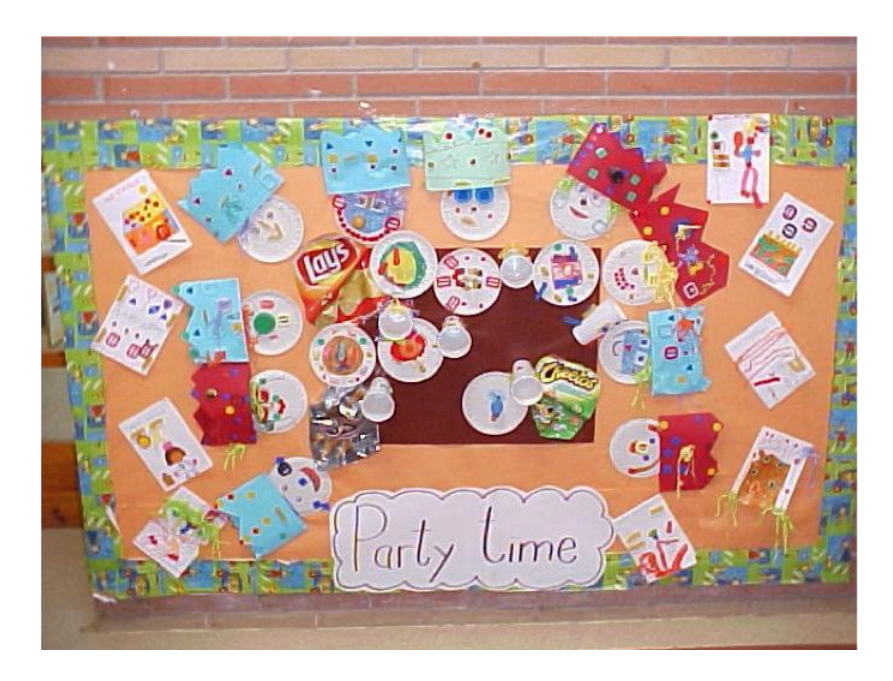
Photograph 2: Project Work of Children

The activities that integrate a project program will be effective in the measure that they are familiar as well as relatively complex regarding the previous knowledge of the students. The goal of this type of program is to develop in the students the capability to interpret, to produce and to negotiate meanings. Besides a specialized formation on infant teaching, to be a proficient FL speaker, to have a global vision of the fundamental characteristics of the organization and structure of the speech and the language itself, to know the methodology for the teaching of languages, to be conscious of the effort and work that supposes to provide continuity to a project of advancement in the introduction of a FL, etc., the specialist of English in this educational period has to be able to observe, to register and to analyze verbal and non-verbal interactions that take place in the classroom, that is to say, his/her own behavior and the one of his/her students.