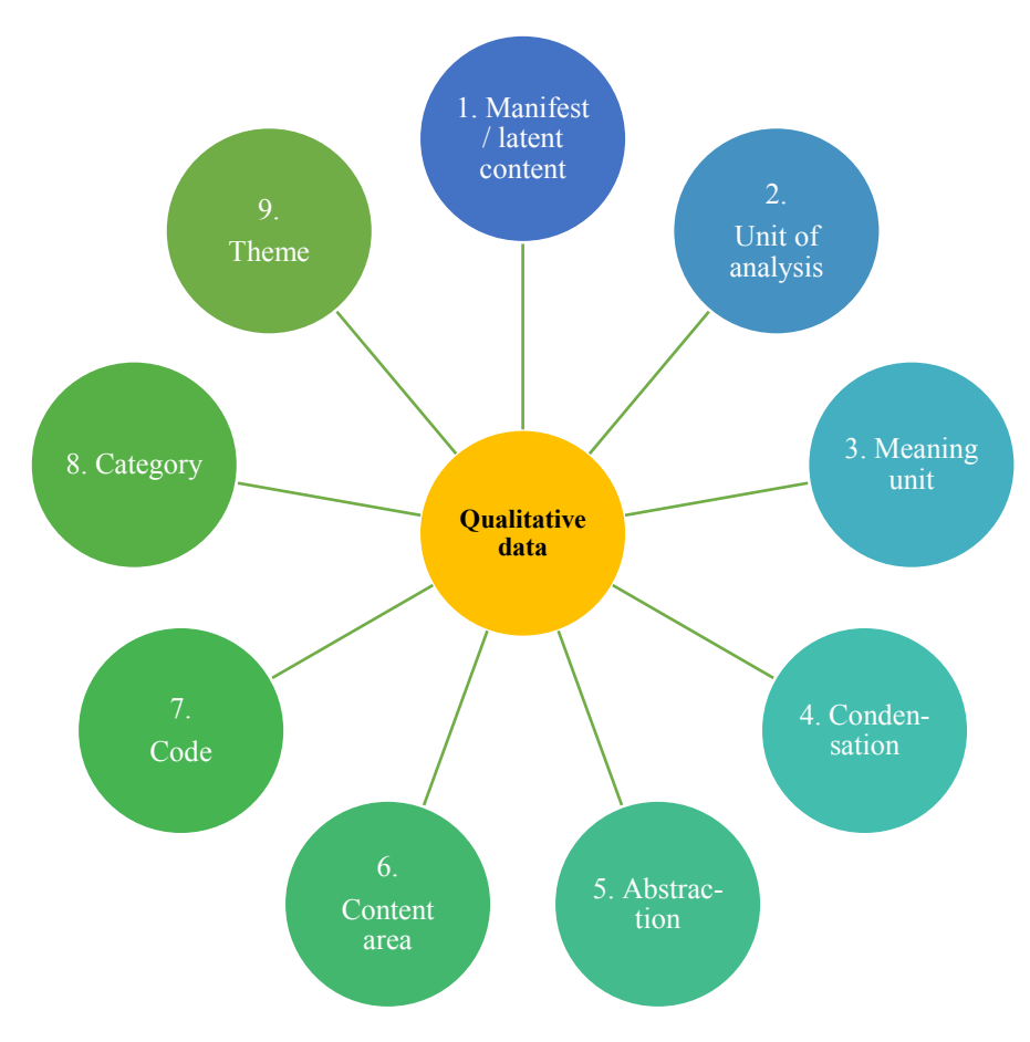
Figure 3. Concepts used during qualitative data analysis