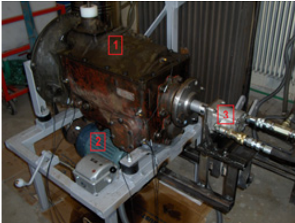
Figure 1. Experimental setup. (1-mechanical gearbox, 2-three phase AC motor, 3-hydraulic dynamometer)