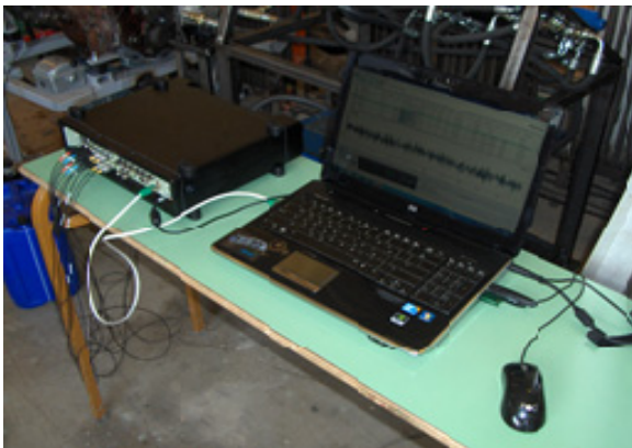
Figure 2. Vibration data acquisition system