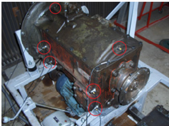
Figure 3. The points on which the accelerometers were placed

Three different loads were decided to apply at gearbox output axis (0Nm, 5Nm and 10Nm). The speed at gearbox input shaft was defined at 2700rpm. The health condition of the gearbox (vibration