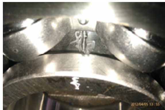
Figure 5. Vertical grooving at No.1 ball bearing's inner ring (3mm width and 1mm depth)

All the bearing faults were based after extensive research in literatures. All the faults were artificial faults similar to the real faults (Figures 5 and 6).