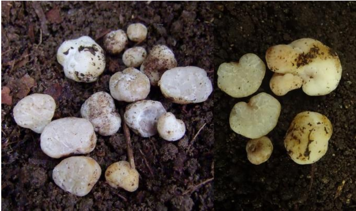
Figure 3. Ascocarps of Tuber puberulum

Tuber puberulum was reported previously from Turkey only once by Elliot et al. (2016) from the localities within the boundaries of Aydın (Kuyucak), Denizli (Acıpayam, Buldan, Serinhisar), Muğla (Central district, Dalaman, Fethiye), Osmaniye (Central district) provinces.