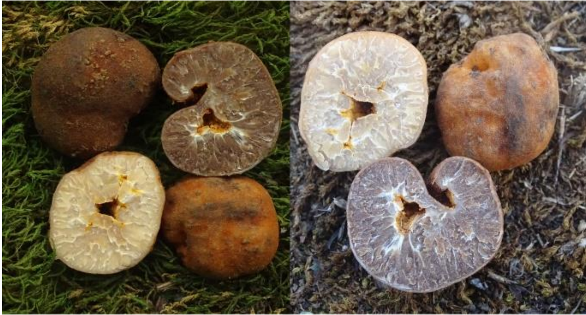
Figure 1. Ascocarps of Tuber excavatum