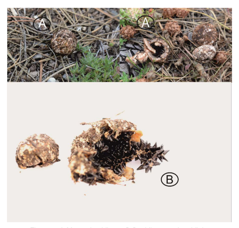
Figure 1. A-Mature basidioma, B-Basidioma and peridiols.

Until now, Geastraceae family is represented by Geastrum (18 species), Myriostoma (M. coliforme) and Sphaerobolus (S. stellatus) in Turkey. With this study fourth Genus, Schenella, will be added Turkish mycota.