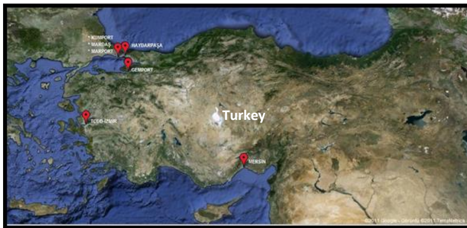
Figure 2: Study area

In the context of national empty container survey, Gempport, Haydarpaşa, İzmir, Kumport, Mardaş, Marport and Mersin ports' which they account for 80.64% of Turkey's container transportation volume have been surveyed (www.denizcilik.gov.tr, 12 April 2015). To obtain reliable and high quality data each port is visited and examined by the authors. The data is gathered from the databases about container handling amounts, related ports' Administrative Managements, Port Presidency, the TSI (Turkish Statistical Institute), Customs General Management and the Under Secretariat of Maritime Affairs were examined (www.tuik.gov.tr, 17 October 2015, www.ubak.gov.tr, 12 April 2015). Additional interviews were carried out with port authorities and data from questionnaires was compiled. The study consists of 7 container transporting ports from different geographies of Turkey (Figure 2).