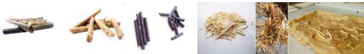
Figure 11. Pellets and natural fibres used in experiments, 1. Canola stalk pellet, 2. molasses pellet, 3. canola and coal dust pellet, 4. molasses and ash pellet [From left to right] and different natural fibers, Dimension: 15x22x0,8 cm.

Pellets are compressed agglomerates used for making biodiesel such as canola or sunflower waste. They help save fuel resources. In our experiments, canola pellets were used in 6x6x6 cm and 15x22x0,8 cm specimens. It was observed that pellet use increases the endurance of the specimen, making it strengthful. Sea grass ( Posidonia oceanica ) has been used by Neptutherm firm as an insulation material. It was observed that the use of small particles of this seaplant provide sufficient hardness and endurance for bioplastic (Figures 11, 12, 13).