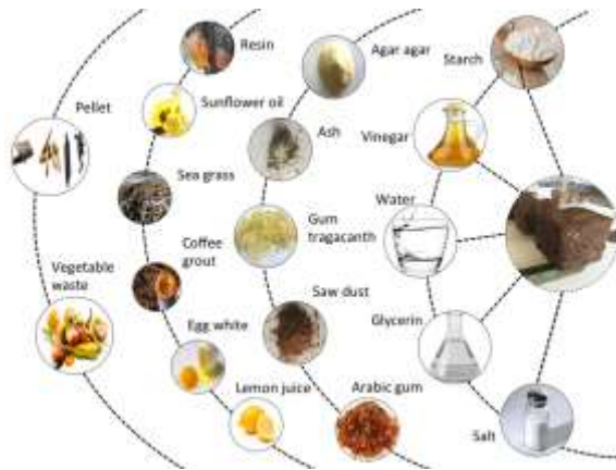
Figure 7. Used additives in order to improve mechanical properties of bioplastic; biopolymers and plasticizers for bioplastic.

Agar agar (E406) is a biopolymer and a polysaccharide derived from red seaweed and is used in food industry. In the experiments agar was used in powder form [2, 166]. Bioplastic mixture was poured in liquid jelly form which resulted as cracks on the surface. Instead solid mixture displayed much better results. It was observed that agar agar acts as a strong biopolymer for starch based bioplastics, as well as dried skin of various fruit and vegetables such as pumpkin seed, fig and corn leaf.