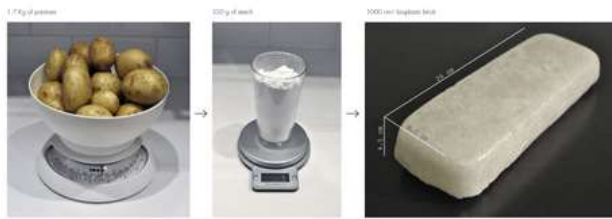
Figure 2. Bioplastic brick by Marilu Valente [7].