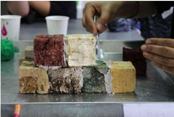
Figure 16. 6x6x6cm cubic modular wall.