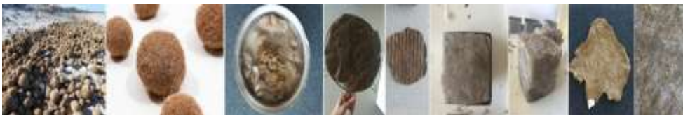
Figure 13. Seagrass ( Posidonia oceanica ) collected from shores of Albania, [14, 15]. Seagrass and canola pellet potato starch bioplastic and pure seagrass potato starch bioplastic, Dimension 5x5x5 cm and potato starch bioplastic with seagrass.