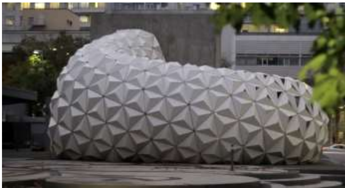
Figure 3. Arboskin pavillion, Stuttgart [8].

Along with these experiments of bioplastic in architecture, further research needs to be done in order to evaluate the performance of starch based bioplastic in architecture. Therefore, deriving from ecological means and the above mentioned examples from an architect or artist approach to bioplastic, this research aims to find out possibilities of starch based bioplastic and biocomposite as a construction material. The focus of this research is to figure out whether starch based bioplastic material can be used in architecture, both as a facade material and an interior space furnishing. The research also aims to understand whether the material can be used alternatively to the cement as a connective material in concrete or perform better when blended with natural and other synthetic fibers. Within the research, vegetable based starch is blended with different additives and biopolymers, natural fibers such as pellet (compressed sunflower, canola and other agricultural waste) and synthetic fibers in order to improve a strength and durable material. The project aims to produce a biocomposite material consisting of organic and inorganic materials that can be used as a surface and furniture. The research expands to understanding how organic and inorganic interventions can be made in order to increase the life span of the material, make it durable and resistant to humid and weather conditions [9].