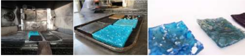
Figure 14. Marble aggregate and synthetic fiber bioplastic with methylene for color, Dimension: 15x15x0,3 and 5x5x0,3 cm.