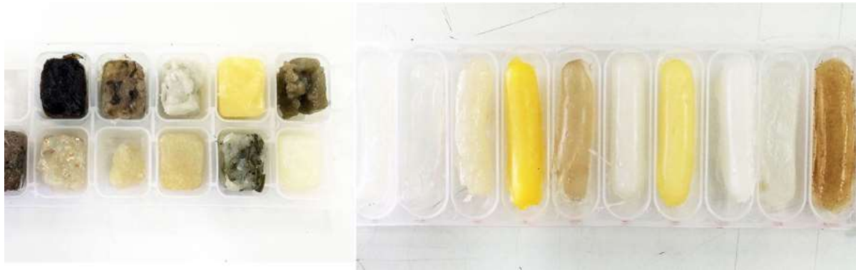
Fig. 1. Simple bioplastic with sand, honey and milk.

Based on the need to rely on sustainable feedstock, depend less on fossil resources and decrease carbon emissions, biomaterials and bioplastics as substitutes of conventional petroleum based plastics have been the focus of many material scientists, architects and industrial product designers. In response to the environmental problems caused by petroleum-based plastics dumped as waste in the oceans, the development of biocomposite materials such as bioplastics represent a paradigmatic shift, driving the evolution of conventional material practices. There are two major advantages to bio-based plastic products: they save fossil resources by using biomass and provide the keenly sought-after possibility of carbon neutrality. Additionally, bioplastics are often biodegradable [1] (Figure 1).