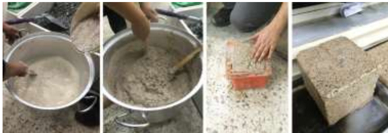
Figure 6. 50% Bioplastic, 50 % Mixture: (Aggregate:0/4 mm), Steel mold, Dimension: 15 x 15 x 15 cm.

Pure bioplastic was mixed with 0-4 mm. aggregates in order to improve the properties of strength. These specimens were molded with 15x15x15 cm steel concrete molds. The results were observed as sponge-like, lightweight material with some cracks on the surface due to open-air drying (Figure 6).