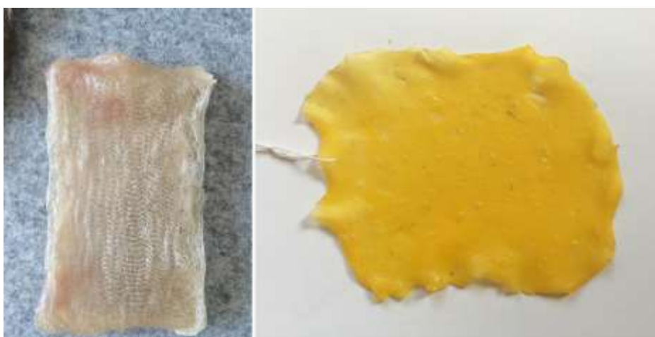
Figure 9. Tapioca starch with agar agar bioplastic.