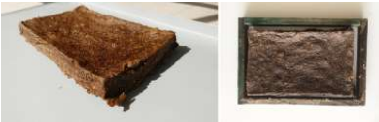
Figure 12. Canola pellet with bee wax, Dimension: 15x22x0,8 cm.