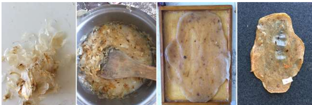
Figure 8. Dried skin of pumpkin seed as a biopolymer with agar agar potato starch bioplastic.

When the blend is poured on a natural rubber or EVA surface rather than steel, glass or wood surface, less crack or deformation on the surface was formed (Figures 8, 9, 10).