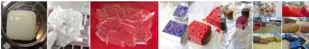
Figure 5. Pure potato and corn starch bioplastic, potato starch in sheet form and corn starch colored modules from the exhibition, realized in a workshop during Tirana Architecture Weeks by students of Polis University in Tirana.

Pure bioplastic was gained with 6x6x6 and 15x22x0,8 cm steel and wooden molds. It was observed that pure bioplastic specimens are not resistant to humid and compression and cracked. Potato, corn, wheat and tapioca starch were used and it was observed that tapioca starch works as the best type of biopolymer in the formation of bioplastic and secondly the potato starch, thirdly wheat starch. The figures show pure three-dimensional specimens (Figure 5).