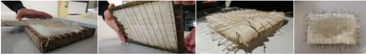
Figure 10. Bioplastic with linen grid, Dimension: 15x22x0,8 cm.