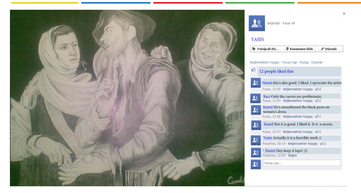
Figure 4. A screenshot of example peer assessment of the painting on Facebook

Kamil: "It happens that peers make positive comments to their close friends. I uploaded the painting of a friend of mine (see Figure 4). The work, a pencil drawing, was not very good actually. Yet the comments were all positive. There were only suggestions about minor corrections. Later, the owner of the painting commented on his own painting saying 'awful work'. Despite all the positive comments he made a self-criticism".