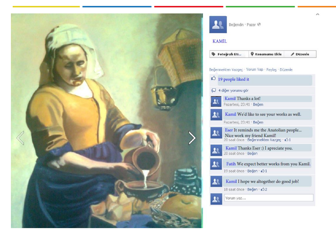
Figure 3. A screenshot of example peer assessment of the painting on Facebook

Baris: "It takes longer time if ask some of our friends in person to comment on our works. However, Facebook is fine... for a fact everybody can see and comment on your work."