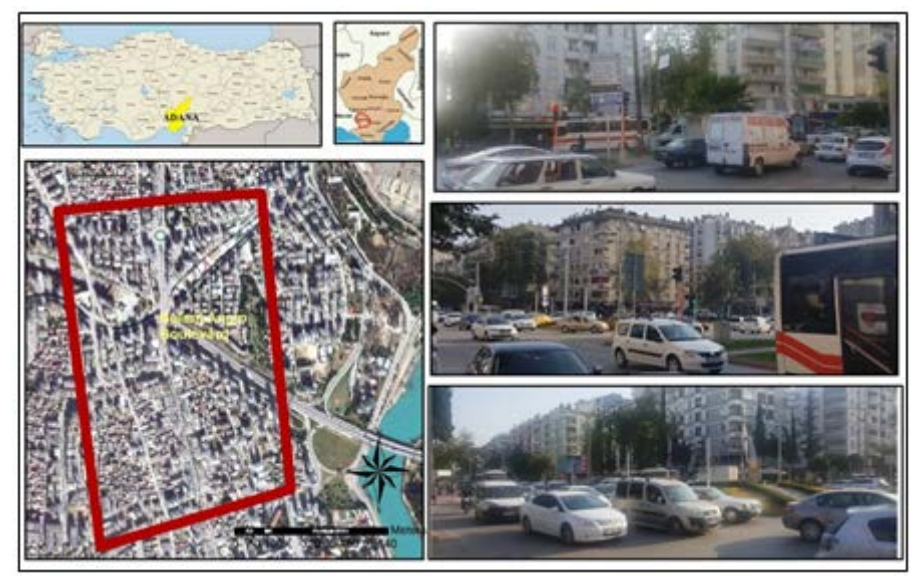
Figure 1. Location of the research area

The research was executed in the pilot area extending to the 1 121 m route of Bulent Angin Boulevard and 112,07 ha area covering 500 m east and 500 m west of this route (Figure 1). The research area is within the boundaries of 4 neighborhoods: Yeni Baraj, Yesil Yurt, Sumer and Beyazevler.