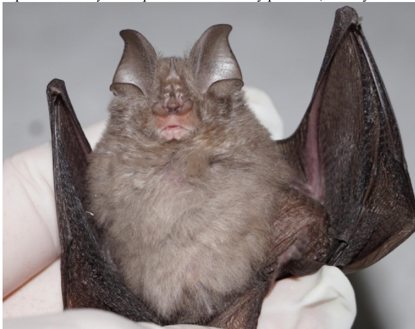
Figure 5. A specimen of Rhinolophus ferrumequinum from Kırıkkale province, Turkey