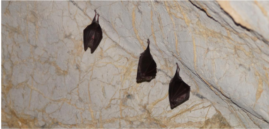
Figure 6. Hibernating specimens of Rhinolophus hipposideros from Karabük province, Turkey