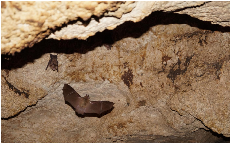
Figure 7. Rhinolophus euryale and Myotis myotis specimens from Kırklareli province, Turkey