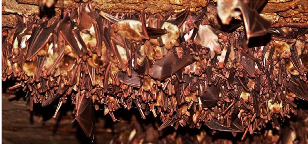
Figure 3. A mixed colony composed of Myotis myotis/blythii from Kırıkkale province, Turkey