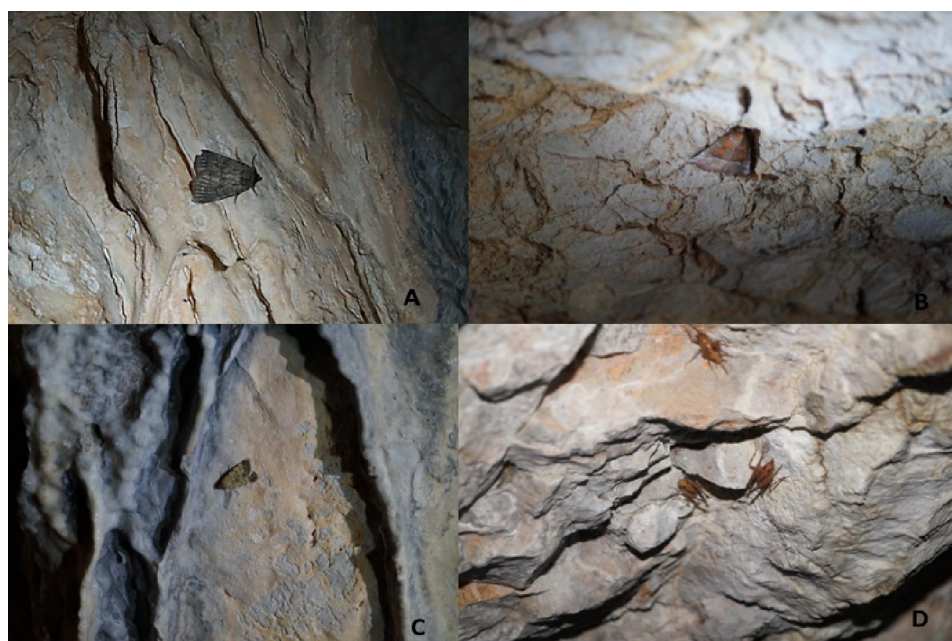
Figure 10. Lepidoptera (A-C) and Orthoptera (D) species from Karabük and Sakarya provinces, Turkey