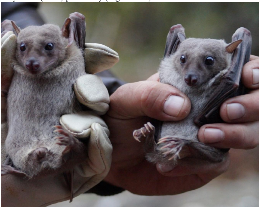
Figure 2. Two male Rousettus aegyptiacus specimens from a cave in Northern Cyprus

The most abundant species were recorded as Rousettus aegyptiacus (Egyptian fruit bat), Myotis myotis (Greater mouse-eared bat), M. blythii (Lesser Mouse-eared bat), M. capaccinii (Long-fingered bat), Rhinolophus ferrumequinum (Greater horseshoe bat), R. hipposideros (Lesser horseshoe bat) and R. euryale (Mediterranean horseshoe bat) in the field trips. The species are in agreement with those as stated by Aşan Baydemir (2014) previously (Figures 2-7).