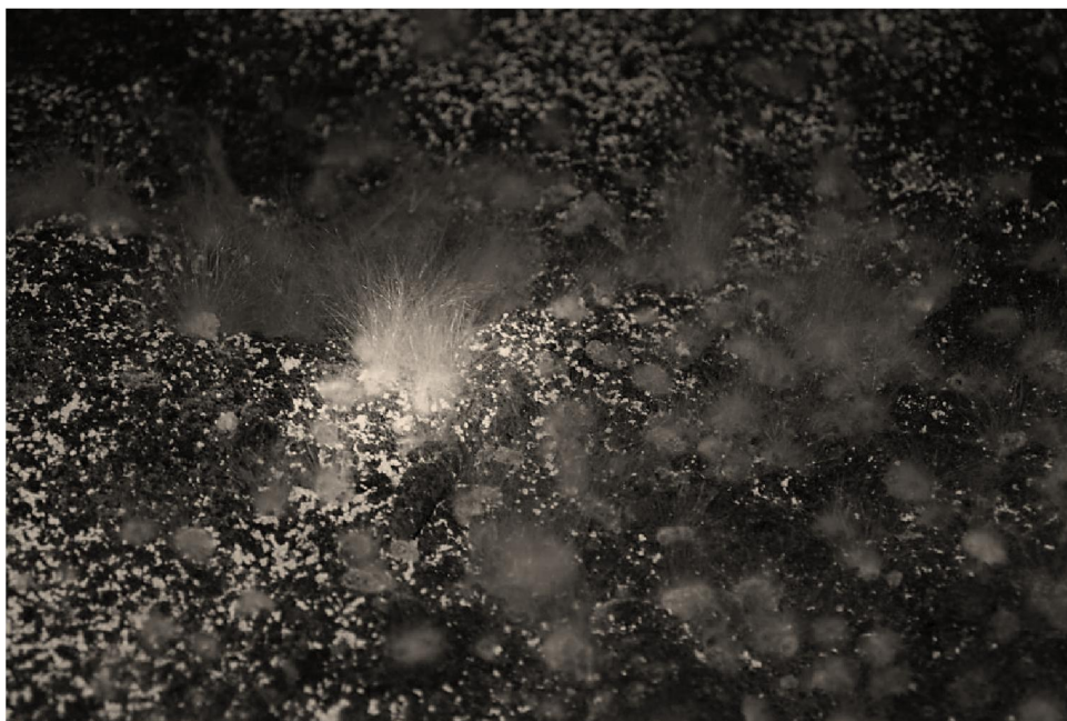
Figure 12. Mucor sp. covering the bat guano from Kırıkkale province.