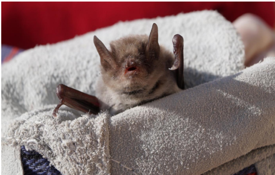
Figure 4. A male specimen of Myotis capaccinii from Hatay province, Turkey