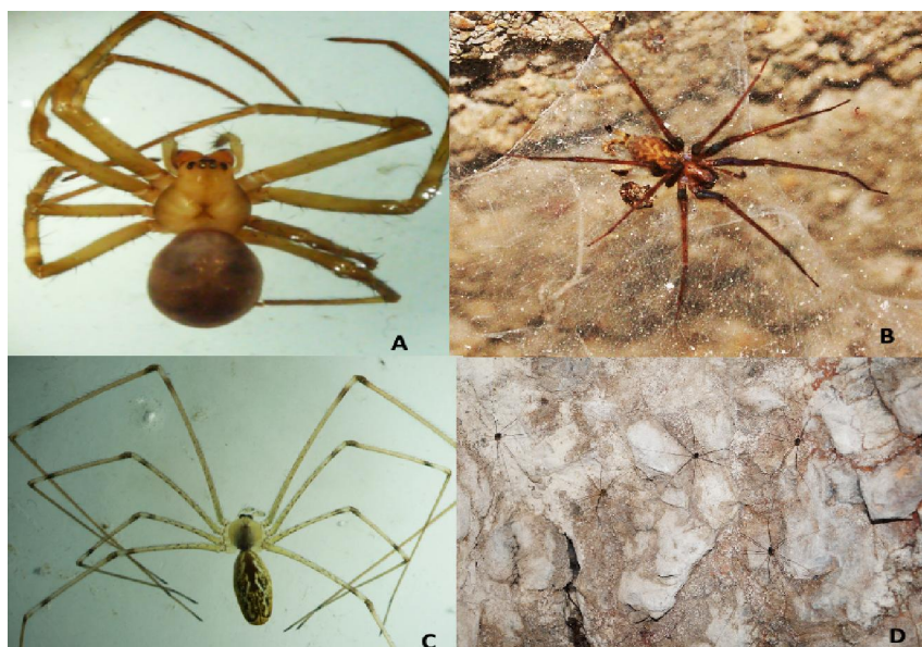
Figure 9. Meta bourneti (A) from Sakarya province, Tegeneria faniapollinis (B) from Kırıkkale province, Holocnemus pluchei (C) from Northern Cyprus and opiliones (D) from Sakarya province.

However, studies on cave dweller invertebrates are very scarce from Turkey and North Cyprus (Kunt et al. , 2010; 2016). Kunt et al. , (2010) examined the invertebrates of caves in detailed with 203 species, including phylum Mollusca, subclassis Oligochaeta and Hirudinea, classis Arachnida, Diplopoda, Chilipoda and Insecta and subphylum Crustaceae in Turkey, and of them, 104 species are determined as endemic to Anatolia. In this preliminary study, we recorded species from the phylum Mollusca, orders Araneae and Orthoptera, Amblypygi, Ophilonies and Coleoptera from the caves (Figures 8-9). Kunt et al. , (2010) recorded Meta bourneti from the caves in Yalova and Bursa provinces, Tegeneria faniapollinis from Hatay province and Holocnemus pluchei from Elazığ and Kahramanmaraş. However the localities, given in the present study from Sakarya, Kırıkkale provinces and Northern Cyprus, are recorded for the first time. In addition, individuals in hibernation from the order Lepidoptera and cave crickets are also recorded near the entrances of the caves from Karabük and Sakarya provinces, respectively (Figure 10).