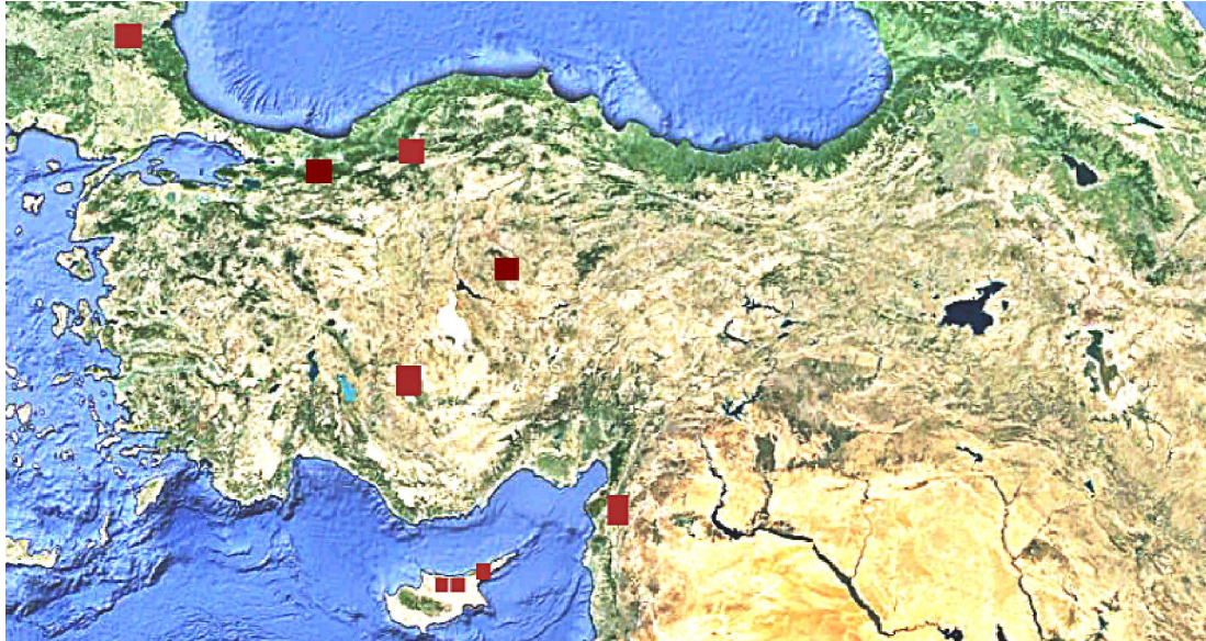
Figure 1. Locations of investigated caves in Turkey and T.R.N.C.

Photographs of the bat colonies and invertebrate species were taken without direct lighting except for the briefest illumination. Bat species were captured by hand or hand nests and identified according to Dietz & Kiefer (2014). For determining the species living on guano piles, guano was collected in sterile petri dishes from some of the caves and the mites and insects were separated under a stereoscopic microscope, photographed and identified. Some of the invertebrate species has been identified only in order rank.