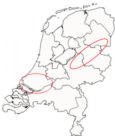
Figure 1. Netherlands Map and 2 of V FNL Switch/MTX Locations

The fire was initially noticed by the NMC (Network Management Centre) who saw an unexpected raise of the temperature in the MTX location. Although there was at that moment no direct impact for the Vodafone services, after a discussion with the fire brigade on-site and the initial impact analysis by Vodafone the internal crisis management procedure was started at 06.00 hours, due to the high potential impact. A crisis management team was formed, relevant staff was mobilised, the two designated crisis war rooms became fully operational and a mobile disaster recovery truck (containing of a spare MTX and transmission equipment) was send on site. According to the established recovery procedures backups of the data was made to prevent data loss in case of equipment failure or destruction. Luckily, due to the fact that both buildings were unmanned at the moment of the fire, there were no human casualties or injuries.