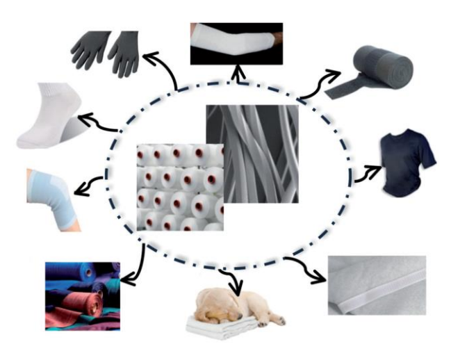
Figure 2. FIR textile products [18].

the risk of injury. FIR textile products can help to heal injured, over engineered muscles, tendons and bonds [2], [27].