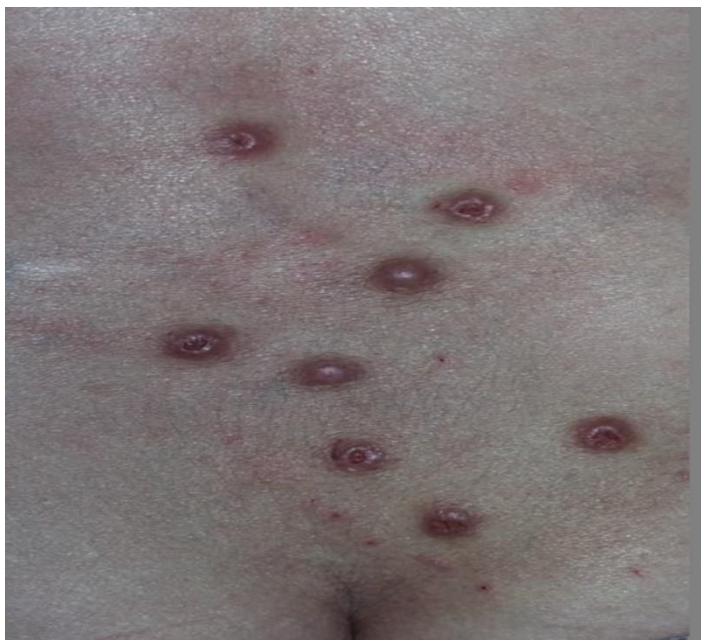
Figure 1: Purple nodules over the lumbar region.

Written consent was taken from the patient.