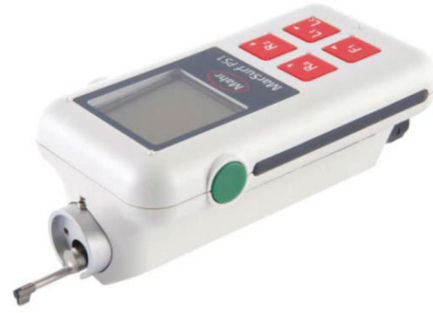
Figure 1. Desktop roughness measurement instrument

Here y_i =the observed data at the i_{th} experiment and n = the number of the experiments [4].