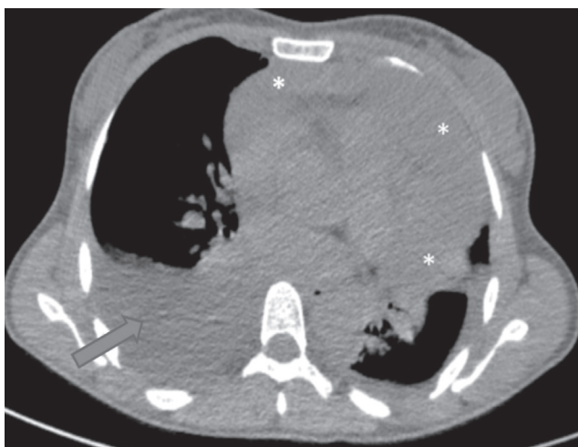
Figure 2. CT image showing pericardial (*) and pleural effusions (arrow).