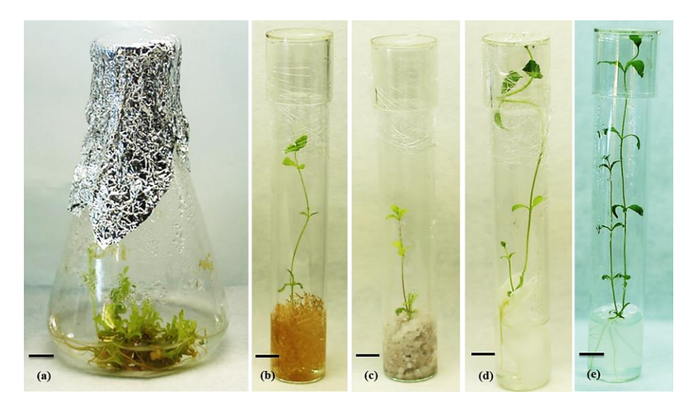
Figure 1. The growth of the plantlets after 3 weeks of the initiation culture: (a) Liquid culture in 250 mL flasks (LC); (b) Liquid culture in tubes with loofa sponge (LCLS); (c) Liquid culture in tubes with perlite (LCPE); (d) Liquid culture in tubes with filter paper bridge (LCFPB); (e) Solid culture in tubes with reduced agar (SCRA) (bars = 1.0 cm).

In the beginning, the influence of the different substrates on in vitro plantlet growth was determined (Table 1). The LC and LCLS showed 100% and 34.3% vitrification rate, respectively, and the results implied their unsuitability for the culture initiation (Figure 1a, b). The culture of the explants on LCPE resulted in the development of very thin shoots and small leaves, and the rooted shoots showed a 49% vitrification rate. Therefore, LCPE was not suitable for the initiation of the culture (Figure 1c). Although, in the LCFPB (Figure 1d), the development of the shoots was as good as that in the SCRA, the rooting rate was less than that in the SCRA (Figure 1e) (Table 1, 2). Consequently, the SCRA was found to be a more suitable system for culture initiation and the removal of rooted shoots with no damage.