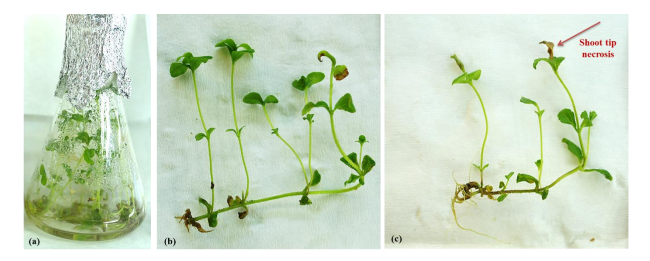
Figure 3. The growth of the plantlets after 2-week CHI elicitation ( a , b ) and plantlet showed shoot tip necrosis ( c ).