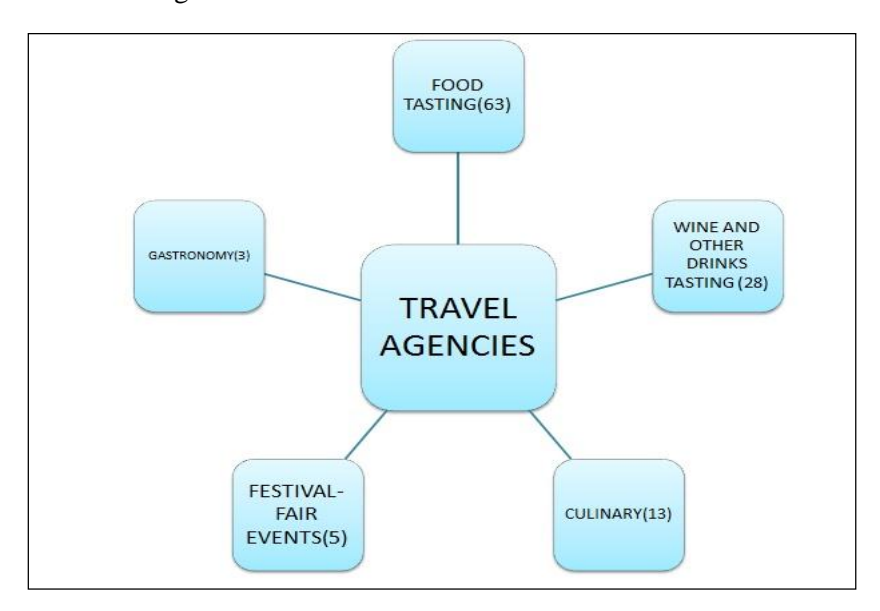
Figure 4. Gastronomic Services Organized by Travel Agencies

It is detected that travel agencies take the gastronomical dynamics of the destination into consideration when they prepare the tour programs. The destinations which are prepared on the gastronomy base are; in Marmara Region İstanbul and Edirne, in Black Sea Region Trabzon, in Aegean Region Şirince, in Southeast Anatolia Region Gaziantep, in Central Anatolia Region Eskişehir and in East Anatolia Region Erzurum and Van were observed as the distinguished destinations.