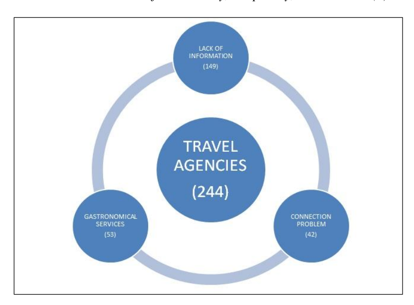
Figure 1. Informations on Promotion and Presentation of Gastronomic Services

The fact that some of the agencies, which was examined in the scope of the research, do not include gastronomical services because of their roles in the market was observed. For example, the travel agencies, which organize Hajj and Umrah tour, Jerusalem tour or Mediterranean tour, highlight the services that is at the focus of the market they operate in instead of offering gastronomical services.