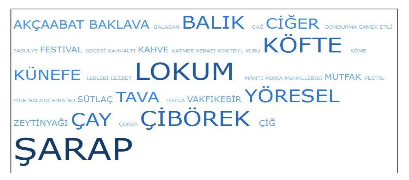
Figure 5. Frequently Highlighted Items During Tours

Tour programs may vary according to the unique gastronomical values of the destinations. In this respect, some destinations step forward in terms of food, beverage and other services. In domestic tours, in terms of beverages it is observed that wine, tea and coffee tasting are popular. In terms of food, çibörek, lokum (Turkish delight) and fish have an important place. When other gastronomical services are examined; it is seen that "locality" point is frequently emphasized.