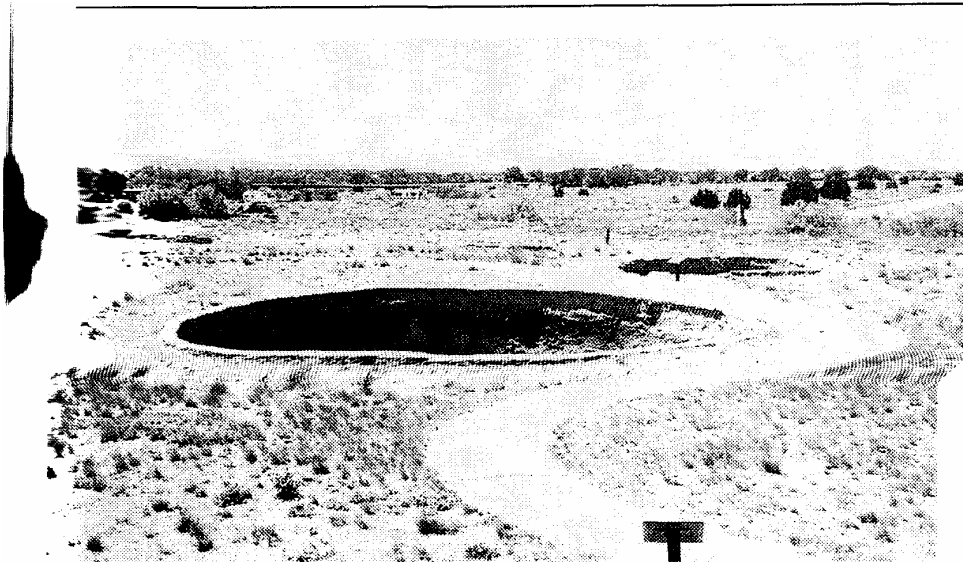
Figure 1 A Kiva