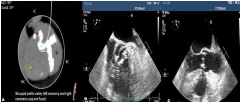
Figure 1. (A) Computed tomography is showing the bicuspid aortic valve and the fusion of left coronary and right coronary cusps, (B) Trans-oesophageal echocardiography demonstrates the bicuspid aortic valve in the short axis, (C) Trans-oesophageal echocardiography demonstrates the bicuspid aortic valve in the long axis.

In BAVs, the possibility of valve embolisation is high because of concomitant AAD incidences. Also, the elliptic shape of the annulus and the presence of asymmetrical calcification are important factors for excellent results (especially for aortic regurgitation and conductance disturbances) after TAVI. SATF bioprosthesis valve is a new second-generation valve with the following unique features: 1) Flexible stabilisation arches that are responsible for the self-aligning properties of the valve ensuring predictable coaxial alignment; 2) Upper crown, which guarantees stable positioning and supra-annular anchoring of the valve, capping the native leaflets and mitigating the risk of coronary obstruction and paravalvular leak; 3) Unlike other devices, SATF has a very low radial force and facilitates optimal implantation with only a few millimeters protruding in the LVOT during the procedure, leading to lower rates of conductance disturbances and 4) The pericardial skirt and lower crown minimise paravalvular leak. Therefore, SATF may be a good choice in patients with severe bicuspid and calcified aortic stenosis owing to these different and effective features.