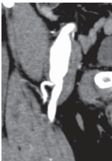
Figure 1. Computed tomography of the aneurysm.

Common femoral artery aneurysms are uncommon and very rarely isolated. Here, we describe a large right femoral artery aneurysm that caused local discomfort and pain. A 60-year-old man was referred to an outpatient clinic of a cardiovascular surgery department. He had a 3-year history of a swelling in the right inguinal region and complained of its increasing size and worsening of pain. An examination of the right groin revealed a painless, pulsatile mass (5-7 cm in size). There was no history of hypertension, connective tissue disorder, Behcet's disease or any intervention in the right groin. Blood pressure was equal in both legs. Complete blood count and other blood test results were within normal limits. He had a smoking history of 25 packs/year. Duplex ultrasound of the mass revealed an aneurysm, measuring 35 × 38 mm, of the right common femoral artery. Computed tomography was performed, which showed a 33.5 mm aneurysm sac in a 5 cm segment (Figure 1). Surgery was performed under spinal anaesthesia. The aneurysm was dissected, and an 8-mm Dacron graft was interposed (Figures 2A and B). The patient was discharged on the postoperative day 2. He had an uneventful recovery, with no complications found at his 1-week postoperative follow-up.