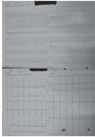
Figure 1. The sample of ECG during application and the sample of ECG after amiodarone infusion.

A 41-year-old male patient was admitted to the emergency department with complaints of palpitations and dizziness. Past medical history revealed that the patient was treated with radiotherapy and 5-fluorouracil via right subclavian vein port due to colon carcinoma. The patient's electrocardiography on admission showed monomorphic sustained ventricular tachycardia (Figure 1). Patient was treated with infusion of amiodarone and the rhythm returned to normal sinus rhythm (Figure 1). Transthoracic echocardiography revealed a swinging mass in the right atrium though the image quality was poor. Fluoroscopy revealed dislodged port catheter extending from the right atrium to the pulmonary artery (Figure 2). Since port catheter was considered as the probable cause of ventricular tachycardia, removal of the port catheter was planned. Port catheter was extracted with snare catheter after insertion of 7 French sheath via the right femoral vein (Figure 3). He was discharged on the day of intervention and was well on first month follow-up control.