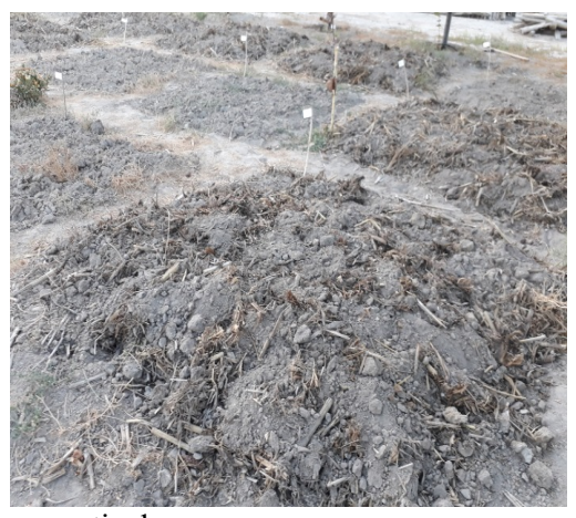
Photograph 1: Images of June, July, August, October respectively

Because tractors cannot be entered into the land, the mixture of the sludge-cornstalks-soil was ventilated by hand. The results and methods of analysis are given below.