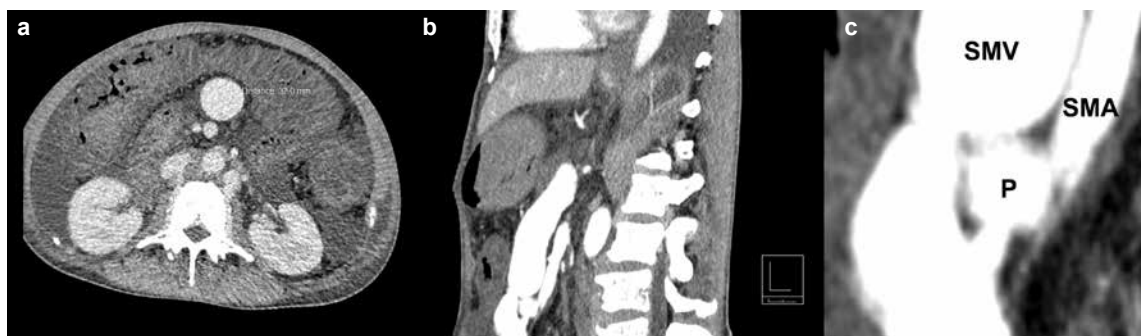
FIG. 2. a-c. Axial contrast-enhanced computer tomography angiography (CTA) of the abdomen showing the dilated superior mesenteric vein (SMV) measuring 32 mm in diameter (a). Sagittal view demonstrating the aorta (A), superior mesenteric artery (SMA), pseudoaneurysm (P) and its position to the dilated superior mesenteric vein (SMV) (b, c).