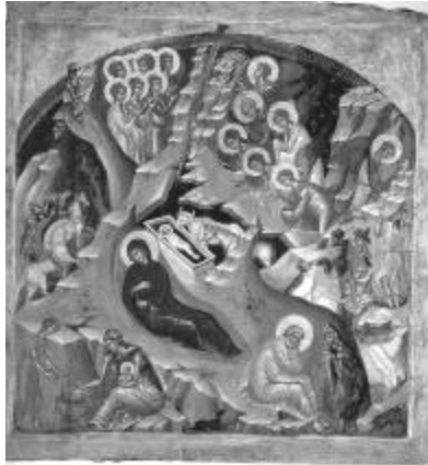
Figure 6. The Nativity, 15th century, former Volpi collection (no. 62), Peratikos collection, London