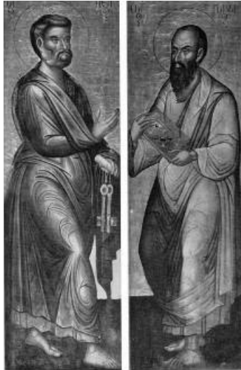
Figure 10. Apostles Peter and Paul, 16th Century, by Michael Damaskinos, Hellenic Institute, Venice