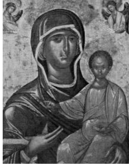
Figure 9. Mary Hodegetria with adoring angels, 16th Century, by Michael Damaskenos, Hellenic Institute, Venice

Iconographically, they depended upon the Italian models and patterns to certain extent as in the case of Madre della Consolazione , witnessed since the 1500s. 13 This