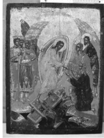
Figure 14. Anastasis , Inv. No. 34.2.82, Museum, Antalya