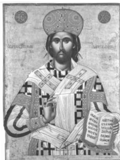
Figure 4. Christ as High Priest, Second half of the 17th Century, Historical Museum, Moscow