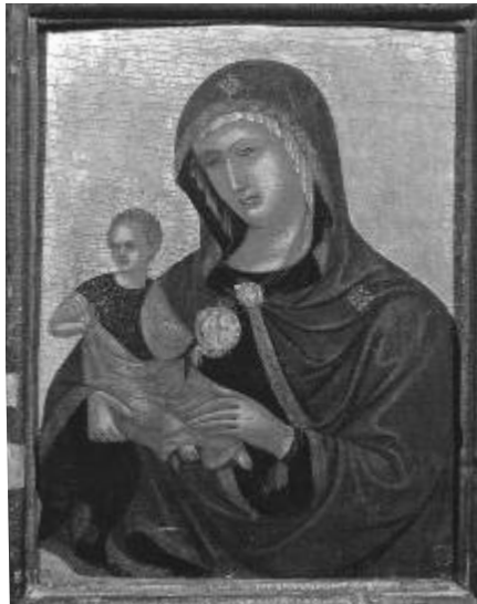
Figure 8. Madre della Consolazione, by Nikolaos Tzafouris, second half of the 15th Century Paulos Kanellopoulos, Collection, Athens