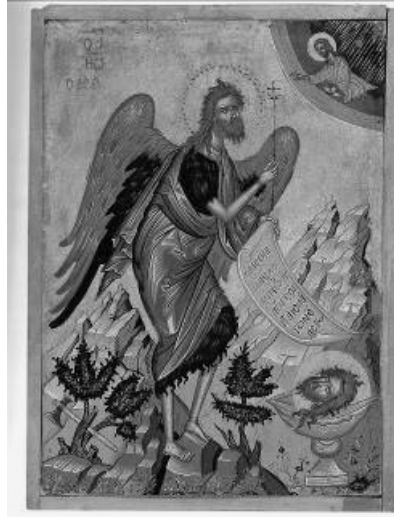
Figure 17. The Winged St. John the Baptist, 16 th century, Hermitage Museum, St. Petersburg