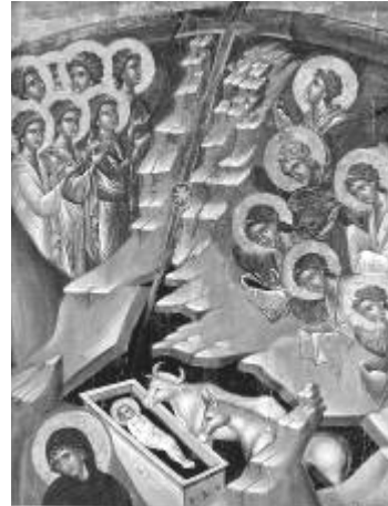
Detail, Figure 6