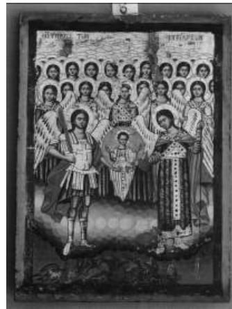
Figure 16. Synaxis of Archangels , Museum, Inv. No. 23.2.82, Antalya