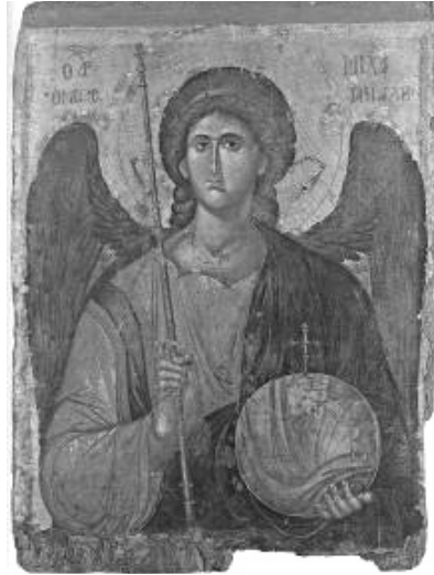
Figure 1. Archangel Michael, first half of the 14 th century, Byzantine Museum, Athens