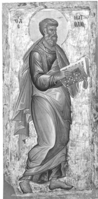
Figure 3. The Evangelist Matthew, Thessalonica or Ochrid, ca. 1295, Icon Gallery, Ochrid, FYR-Macedonia (Photo after: Faith and Power, 2004, fig. 111)