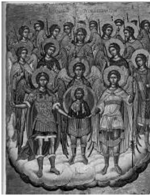
Figure 15. Synaxis of Archangels , Emmanuel Tzanes, 1666, Byzantine Museum, Athens