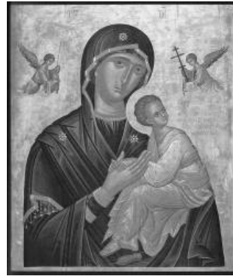
Figure 11. Apostles Peter and Paul, 16th Century, by Michael Damaskinos, Hellenic Institute, Venice (Photo after: Chatzidakis, Icones ,

iconographical type of the Virgin appears to have been established after the middle of the 15 th century, and possibly by the Cretan painter Nikolaos Tzafouris. (Fig. 8) During the second half of the 15 th century, popularity and demand of icons painted in maniera greca increased. The clients were mainly from Crete, Venice and from elsewhere in Europe. 14 In the 16 th century, Greek-Orthodox monasteries undertook significant renovation- and restoration programs and in order to pursue these vast projects artists i.e. painters were employed. 15 An example is the Cretan monk Theophanes Strelitzas 16 (died in 1559), who carried out the wall paintings of the church of Hagios Nikolaos Anapafsas, on Meteora in ca. 1520, he later contributed to the painting of frescos of the Stavronikita monastery, on Mount Athos, (1527-1558) and of the Great Lavra. He painted also at least twelve icons for the renovated iconostasis.