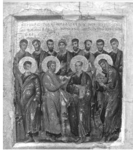
Figure 2 Synaxis of Apostle, Constantinople, first half of the 14 th Century, State Pushkin Museum of Fine Arts, Moscow

4), the Virgin Mary as Zoodochos Pege or St. John the Baptist as Angel in the Wilderness. Mosaic icons of the period also show different exquisite craftsmanship. 3 (Fig. 5) A painterly and narrating character is observed in the painting from the second half of the 13 th century onward. The colour palette expands and compositions reveal rich colour combinations. Architecture and landscape are accentuated and make up an intrinsic part of the compositions. Some stylistic features are as follows: voluminous figures with small heads, expressive facial gestures, hovering garments, which give ultimately the impression of a boneless sweeping body. 4 (Figs. 1, 2 and 3).