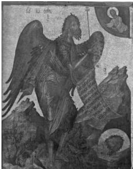
Figure 7. The Winged St. John the Baptist, by Angelos, Mid-15th century, Byzantine Museum, Athens (Photo after: Byzantine Museum, 1998, fig. 28)

Nikolas Philanthropenos (active in 1375-1440), born in Constantinople, worked as mentor on the island in Heraklion. Andreas Ritzos 11 (Fig. 11) (active in 1451-1492) belonged to a painters-family and from 1420 until 1571 the three generations took