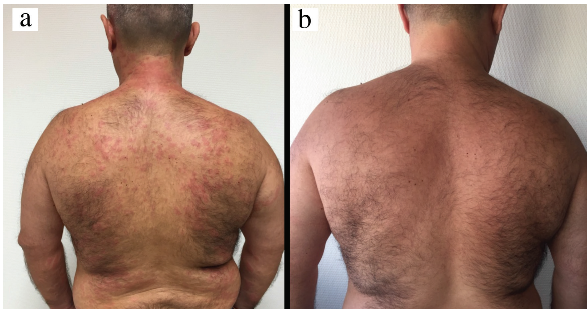
FIG. 1. Urticarial rash on the back (a), Clinical improvement after 1 week of treatment (b).

Treatment with Anakinra 100 mg/day was proposed after a poor clinical response to prednisone at doses of 1 mg/kg/day for 1 month, colchicine 1 gr/day for 45 days and cyclosporin at doses of 4 mg/kg/day for 6 weeks. Evolution after treatment showed substantial improvement with normalisation of the analytical parameters (Figure 1b). No side effects had been reported in the 1 year follow-up. Written informed consent was obtained from