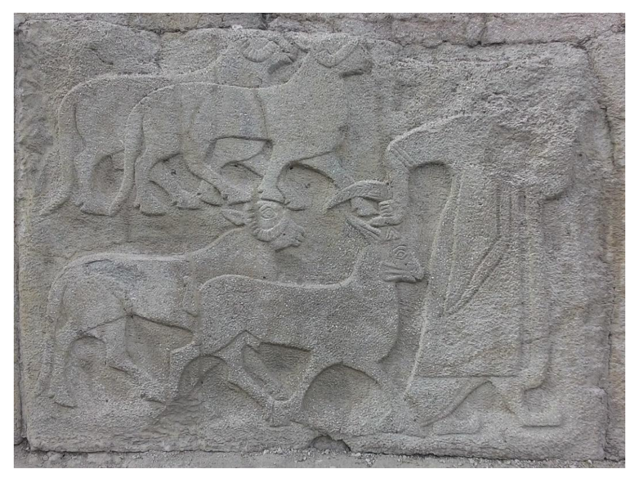
Pic. 4: Ovines, take away for offering. Alacahöyük reliefs.