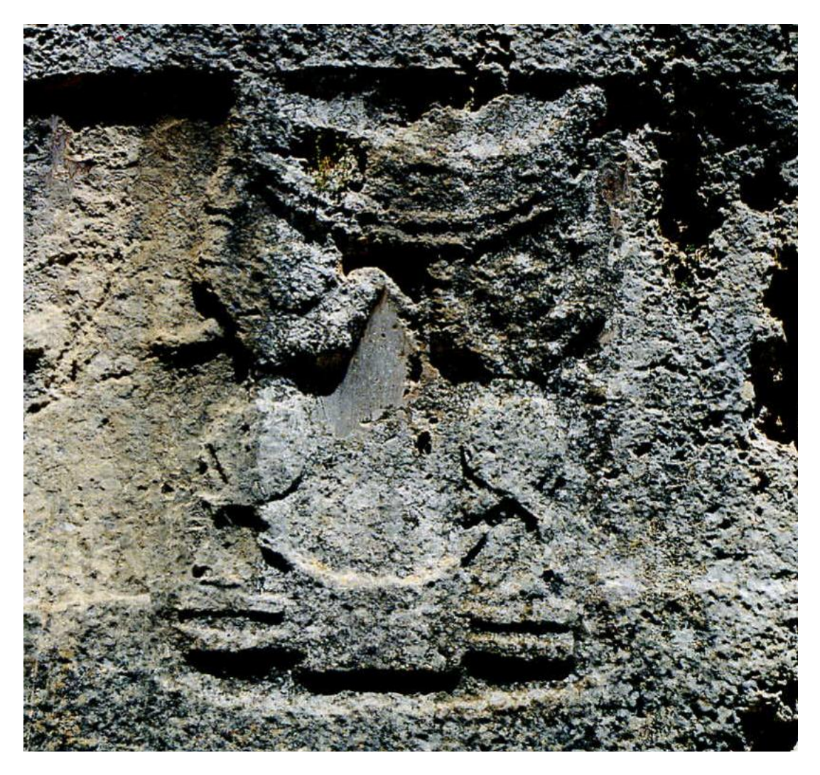
Pic. 1: The figure with animal mask, bear to sundisc. (Yazılıkaya open air temple)