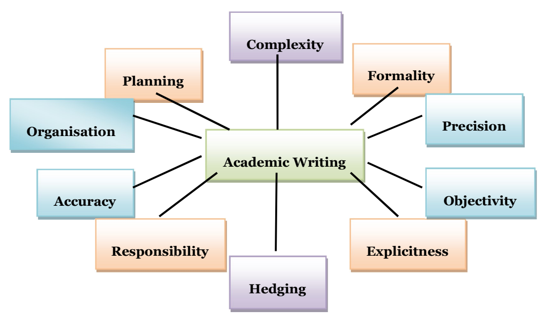
Figure 1: Features of Academic Writing

Broadly speaking, academic writing is characterised by the use of a formal tone, the third-person rather than the first-person, and precise word choice. However, there are ten main features of academic writing that are commonly discussed (Vineski, 2003). These features are represented in Figure 1.