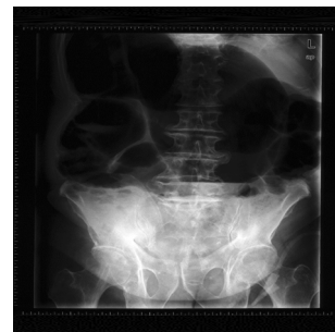
Figure 2. A nasogastric tube was inserted and oral intake was stopped. Two days later, repeated X-ray showed a huge dilatation of the colon