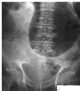
Figure 1. X-ray of the abdomen revealed a huge dilated stomach.