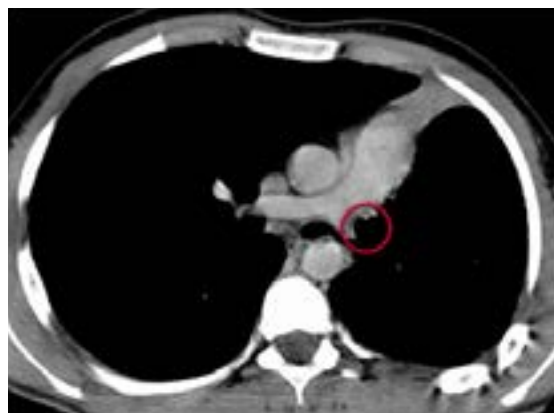
Figure 2. Computed tomography demonstrates the absence of the left pulmonary artery (in circle).