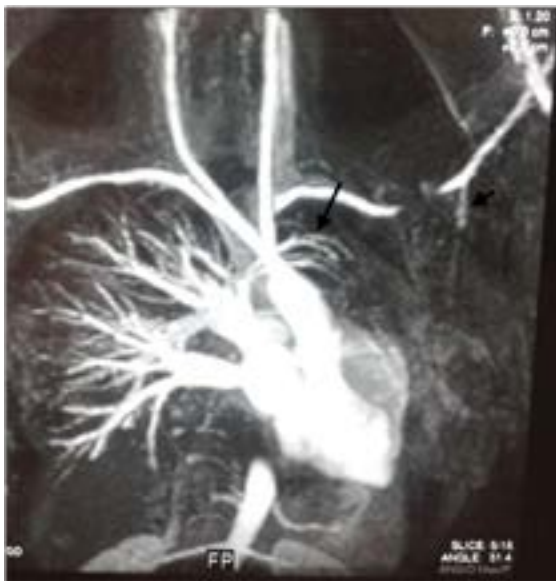
Figure 3. Magnetic resonance angiography demonstrates the absence of left pulmonary artery and the collaterals originating from left subclavian artery (short arrow) and right pulmonary artery (long arrow).