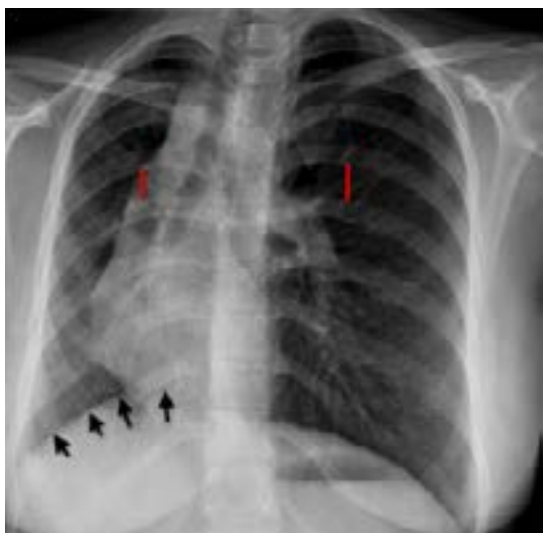
Figure 1. Radiography demonstrates decreased right hemithorax volume, the deviated mediastinum to the right, ipsilateral hemidiaphragm elevation (short arrows), significant left pulmonary artery (thick arrow), absence of right pulmonary artery and small intercostal bone spaces on the right hemithorax (sticks).

A 15 year old boy, has been followed up for IgA deficiency, admitted to the hospital with recurrent cough. His physical examination, laboratory findings and imaging findings were thought to be stemmed from pneumonia caused by IgA deficiency. In the respiratory function tests, FEV1/FVC ratio was found compatible with mild restrictive pattern. Computed tomography (CT) scan revealed the absence of the left pulmonary artery (Figure 2).