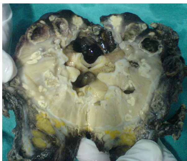
Figure 2. Destruction of renal parenchyma and yellow colored nodular masses in major calyx. Perforation area was seen on the posterior aspect of the removed kidney.