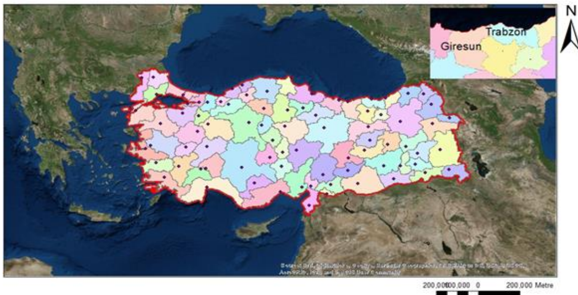
Figure 2. Location of the study area

The study was conducted on 120 forest workers, all of whom were selected by random sampling method. In the study, questionnaires consisting of 10 questions about demographic characteristics, 5 related to works, 3 related to habits and 2 related to work satisfaction were used. The questionnaire was conducted with face-to-face interview method by 3 forest engineers.