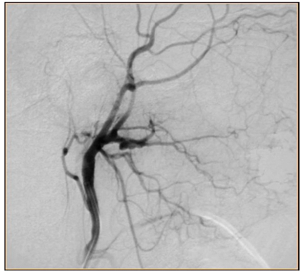
Figure 4. After embolization of the internal maxillary artery.

of JNA (1,5,11) (Figure 2). Early postoperative CT is reliable in detecting or excluding residual disease in patients with JNA (2,24). MRI provides additional assessment of the tumor's interface with adjacent soft tissue and is particularly valuable in evaluating intracranial and cavernous sinus extension.