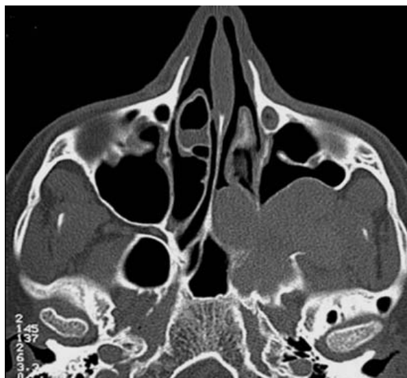
Figure 2. Axial CT; The posterior wall of the maxillary sinus has been bowed anteriorly (arrowed)

quently in patients with FAP (3,5,14). This gene regulates the beta-catenin pathway which influences cell to cell adhesion. Mutations of beta-catenin have been found in sporadic and recurrent JNA (13).