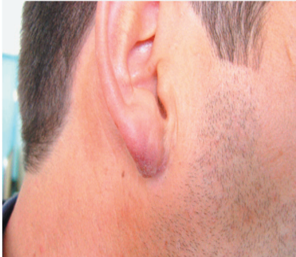
Figure 1. A purple-blue colored plaque on the ear lobe