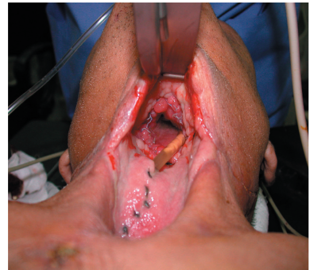
Figure 1. View of the large pharyngocutaneus fistula at the anterior side of gastropharyngeal anastomosis.

and prepared. By starting the dissection from distal to proximal under pneumonotic tournique, the flap was raised over paratenons without extensor tendons (Figure 2). The first dorsal metatarsal artery as a terminal branch of the dorsalis pedis artery was found, tied and included into the flap between the heads of first and second metatarses. At the proximal side the dorsalis pedis artery, it's two concomitant veins and saphen vein were dissected 15 cm proximally and included in the flap. After checking the perfusion of the flap, all the vessels were clamped and