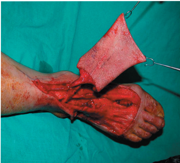
Figure 2. Raising the flap of 12 x 10 cm in dimensions over paratenons without including of extensor tendons.

and prepared. By starting the dissection from distal to proximal under pneumonotic tournique, the flap was raised over paratenons without extensor tendons (Figure 2). The first dorsal metatarsal artery as a terminal branch of the dorsalis pedis artery was found, tied and included into the flap between the heads of first and second metatarses. At the proximal side the dorsalis pedis artery, it's two concomitant veins and saphen vein were dissected 15 cm proximally and included in the flap. After checking the perfusion of the flap, all the vessels were clamped and