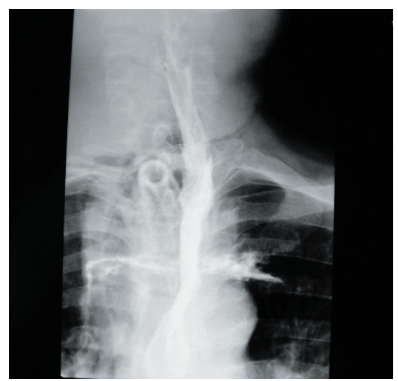
Figure 4. The barium radiography obtained 3 weeks after operation demonstrating the passage to be intact. There is no fistula or stenosis.