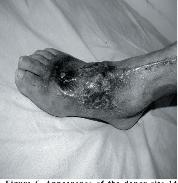
Figure 6. Appearance of the donor site 14 months after operation. Skin graft healed uneventfully.

Local procedures such as rhomboid flaps, rotation and transposition flaps, and lateral cervical flaps have been used (5). However,