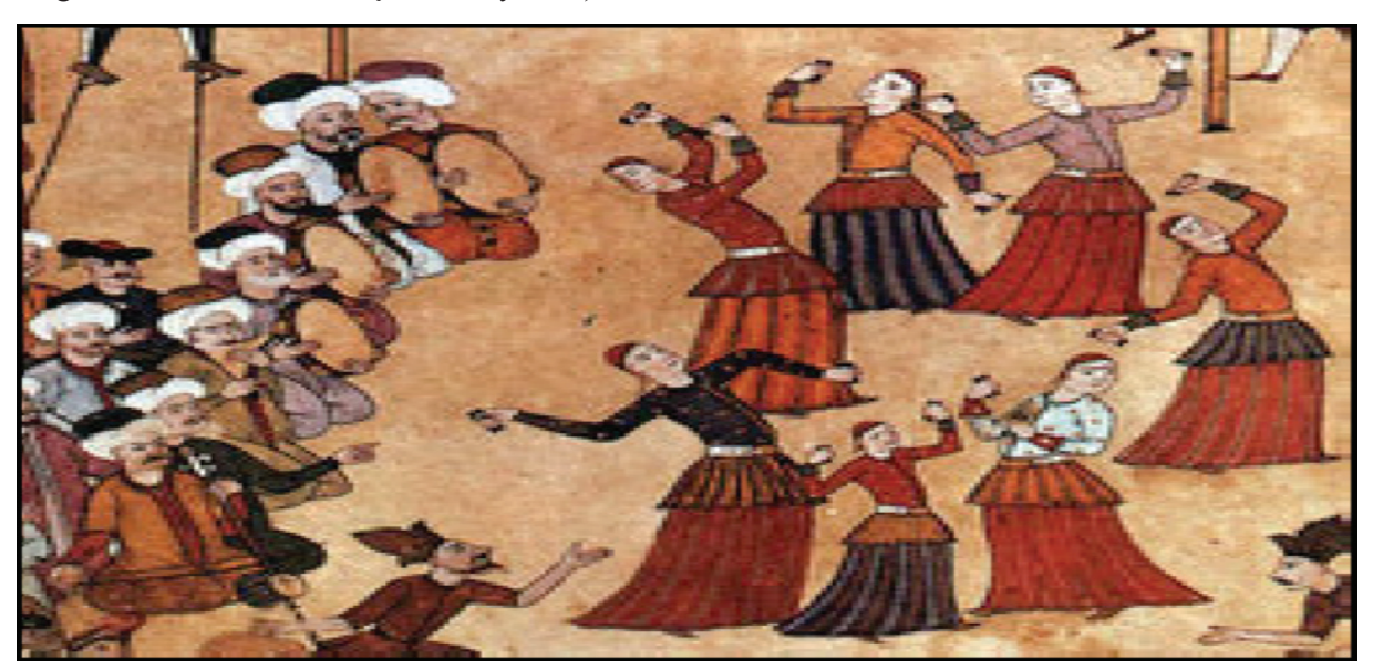
Photo 4: Ottoman Festival in miniatures, 1970. (ATIL, Esin, 1999, Levni and Sûrnâme, Koçbank, p.6)