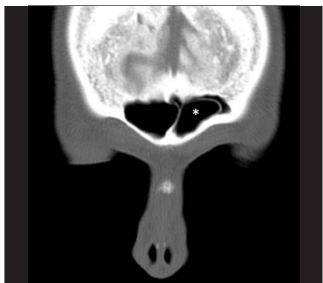
Figure 2. Coronal non-contrast paranasal sinus CT image shows a frontal cell Type 4 in the left frontal sinus (*).