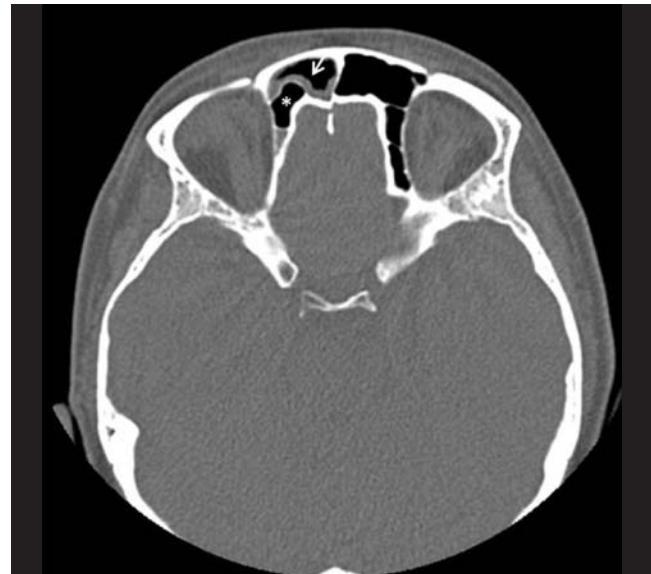
Figure 3. Axial non-contrast paranasal sinus CT image shows a frontal cell Type 3 in the right side (*) and right frontal sinusitis (white arrow).

Non-contrast paranasal sinus CT taken on a coronal plane is the most commonly preferred imaging technique in revealing the anatomy of paranasal sinuses in detail. [4] The variations of paranasal sinuses are often detect in routine paranasal CT examinations, and have been reported in different studies with wide ranges. [6,7] In this study, we