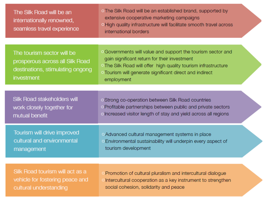
Figure 2. Vision chart in unto [4].

These networks carried more than just merchandise and precious commodities however: the constant movement and mixing of populations also brought about the transmission of knowledge, ideas, cultures and beliefs, which had a profound impact on the history and civilizations of the Eurasian peoples. Travelers along the Silk Roads were attracted not only by trade but also by the intellectual and cultural exchange that was taking place in cities along the Silk Roads, many of which developed into hubs of culture and learning. Science, arts and literature, as well as crafts and technologies were thus shared and disseminated into societies along the lengths of these routes, and in this way, languages, religions and cultures developed and influenced each other. "Silk Road" is in fact a relatively recent term, and for the majority of their long history, these ancient roads had no particular name. In the mid-nineteenth century, the German geologist, Baron Ferdinand von Richthofen, named the trade and communication network Die Seidenstrasse (the Silk Road), and the term, also used in the plural, continues to stir imaginations with its evocative mystery [3].