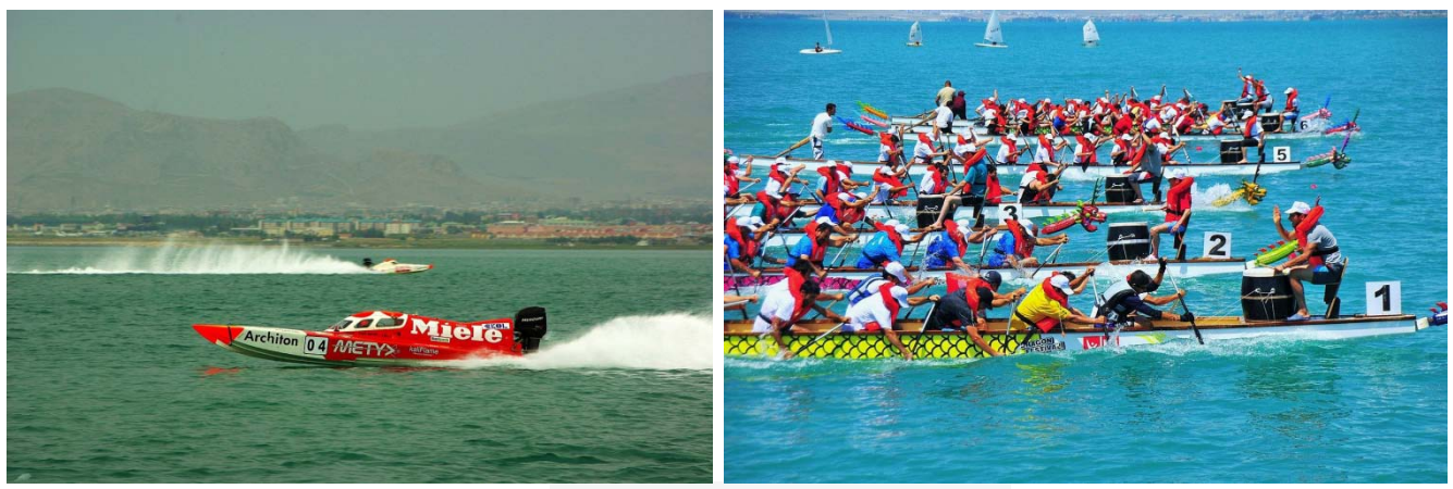
Figure 3. IOC Offshore Van Grand Prix 2010 [7] Figure 4. Festival of Van lake 2011 [7]

Tourism has been defined in the dictionary: traveling in diameters of the world and traveling for recreation and that passenger goes to destination and then return to their residence. The explorers like Ibn Battuta (10<sup>th</sup> century) Marco Polo (14<sup>th</sup> century) Evliya Çelebi (17<sup>th</sup> century) and others in the past pave the way to the word of tourism, traveling to unknown lands and record them. Today in the global village, in the age of advanced communications and with a fast means of transportation, tourism hasn't such a meaning. More travelers and tourists are traveling for leisure and recreation or visit and relax or visit places of historic buildings and familiarity with the culture and customs of other nations. Most people with few resources as possible can take a few days to travel. In this era of mass tourism, and more people than ever are able to travel.