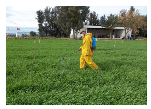
Figure 1. Herbicide treatments applied in field experiments.

The effect of herbicide treatments on ryegrass biomass and wheat yield was evaluated at maturity. In the north of Tunisia, the wheat crop is generally harvested during the second half of the month of June after maturity. At June 25^{\text{th}} , 2012 the wheat yield was sampled, in each experimental unit, from four quadrates of 1 m<sup>2</sup> at maturity and yield was determined in tons per hectare (t ha<sup>-1</sup>). Similarly, ryegrass biomass was sampled, in each experimental unit, from four quadrates of one square meter (1 m<sup>2</sup>) at maturity and yield was determined in gram per square meter (g m<sup>-2</sup>).