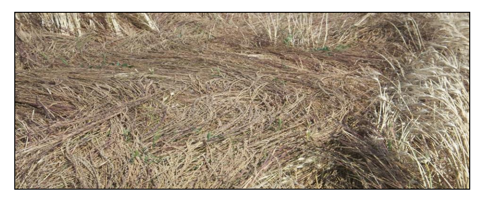
Figure 4. Effect of high density of ryegrass on wheat.

RM: yield of the treated plots (average of all herbicide treatments) in t ha<sup>-1</sup>, RMT: yield of untreated control plots in t ha<sup>-1</sup>, LY: loss in yield of wheat caused by ryegrass for each location (LY = RMT - RM) in t ha<sup>-1</sup>, Values followed by the same letter within a column do not differ significantly (P = 0.05).