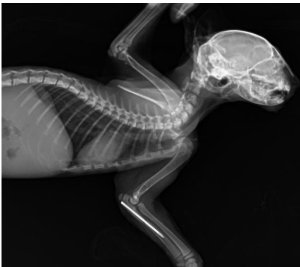
Figure 2: Postoperative lateral radiography: Type I Monteggia fracture with 1.2 mm intramedullary nail in ulna.

The kitten presented as a case was anesthetized with xlazine (0.15 mg/kg, iv, Alfazyme®, Atafen, İzmir, Turkey) and ketamine (15 mg/kg, iv, Ketazol®, Richter Pharma, Wels, Austria) following the shaving and operation preparation of the elbow joint and radius ulna area. The kitten was positioned in lateral recumbency. The operation region was restricted to sterile cover and an electrolyte solution (saline 0.9 percent, Poliflex®, Tekirdag, Turkey) was administered intravenously at 10 ml/kg/hour for operation duration. Then the ulnar fracture line was revealed by opening the skin and subcutaneous facial tissues. Ulnar fracture was fixed with intramedullary nail sent from the processus olecrani. After fixation, the reduction of the radial head was easily completed (Figure 2). The ligamentum radii annulare was repaired by suturing with 4/0 polypropylene. After repairing the ruptured ligament, joint reduction was achieved easily. But no surgical intervention was made in the joint capsule. The operation line was appropriately closed with separated suture techniques using 0 number silk thread. Bandage not was applied to the relevant extremity.