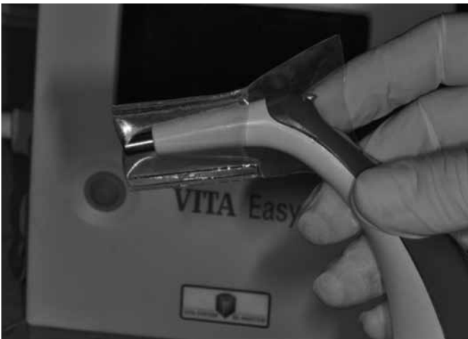
Figure 1. Intraoral spectrophotometer Vita Easyshade®.

All statistical analysis were performed using the Statistical Program STATISTICA 7.1 (Stat. Soft, Inc.; Tulsa, OK, USA). To evaluate the relationship between tooth color, skin and eye color, Pearson's test was used. Chi square test of independence were selected to evaluate bivariate relationships among variables. Confidence level was set to 95% and p values less than 0.05 were considered as significant.