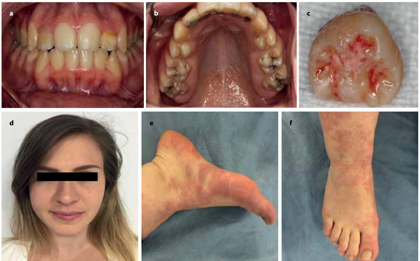
Figure 1. a-f. Intra-oral views of patient; (a) note the macrodontic teeth #12, #22, #32, #42, #31, #41, shovel-shaped teeth #11, #21, enamel opacity on tooth #12, enamel hypoplasia on tooth #22, (b) extra palatinal tubercles on teeth #17, #27, Carabelli tubercles on teeth #16, #26 and (c) extracted macrodontic multituberculated tooth #38. Extra-oral views of patient; (d) showing no abnormality and (e, f) Pink birth mark extending from her first toe of the right foot to her right leg.

Ekman-Westborg and Julian (2) described multiple macrodontia and multituberculism affecting only the teeth with no other systemic anomalies. This condition has been referred to as Ekman Westborg-Julin Syndrome, Ekman-Westborg-Julin Trait and multiple macrodontic multituberculism in the literature (3-9). Because these multiple anomalies are unique to the teeth and it's not a syndrome, we preferred the term "Ekman-Westborg-Julin Trait" (6). So this case was considered to be a variant of the Ekman-Westborg-Julin Trait due to the presence of the dental morphological anomalies including macrodontia affecting maxillary laterals, mandibular incisors