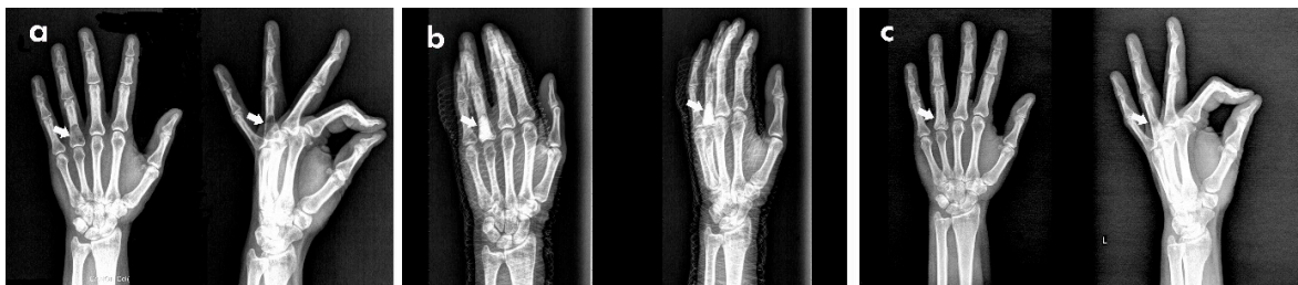
Figure 1a) A 38 years old woman enchondroma on the fourth proximal phalanx 1b) Ca-P cemented postoperative graphics 1c) 15 th month graphics after treatment; the cement is completely resorbed and new bone formation occurred.

The mean pain score (out of 10) significantly decreased from 5.56 \pm 2.85 (0-8) preoperatively to 0.62 \pm 1.02 (0-4) ( p = 0.001 ), Wilcoxon Signed Ranks Test). According to the Strickland classification, 15 patients out of 16 were excellent and one patient with deformity had poor results. The mean Q-DASH score was (out of 100) 7.3 \pm 11.9 (0-50) after treatment. Average return to work and daily activities of the patients were 4 weeks. When the patients' grip and pinch strengths were compared with the contralateral extremity, 90% recovery of grip strength and 85-100% of pinch strength were obtained. Grip and pinch strengths of the affected extremity were not found to be significantly different when compared to the contralateral extremity except lateral pinch (Table 2).