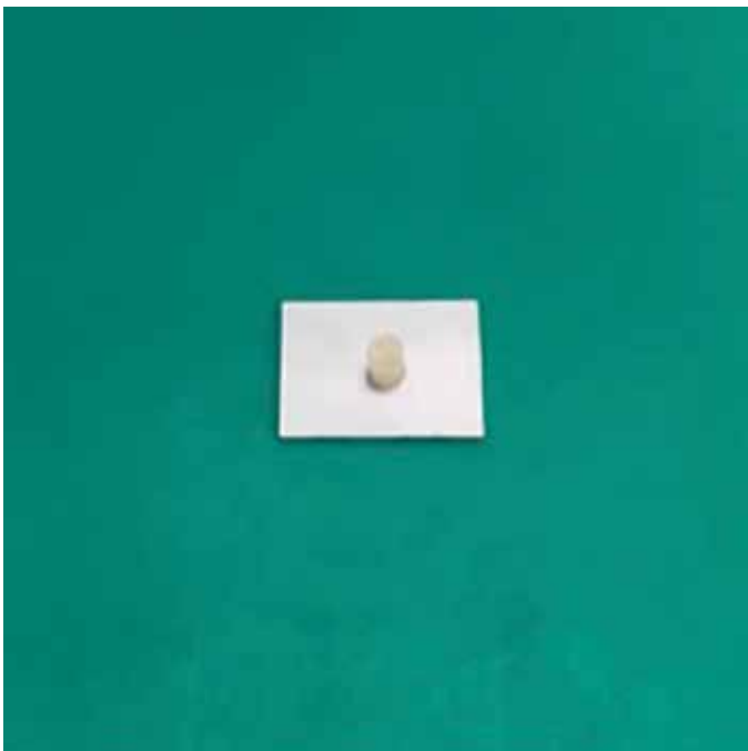
Figure 1. A test sample with 3 mm thick resin layer before being subjected to shear bond strength testing.

MPa: megapascal; SD: standard deviations