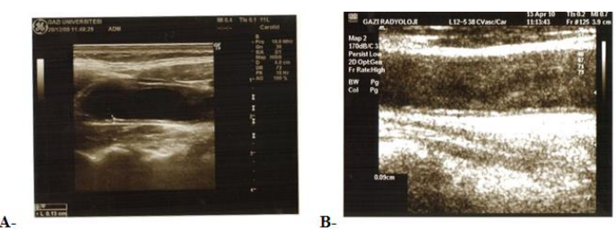
Figure 1: IMT (mm) measurement before statin (rosuvastatin 10 mg/dose) treatment (IMT: 1.13 mm (0.13 cm)) (A). IMT measurement after statin (rosuvastatin 10 mg/dose) treatment (IMT: 0.9 mm) (B) (*patient carotis IMT (mm) measurement from our study)

Table 1: Median and IQR values of all groups